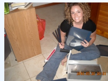
Tab is working on some material that will help build the foundations for these beautiful souls above.